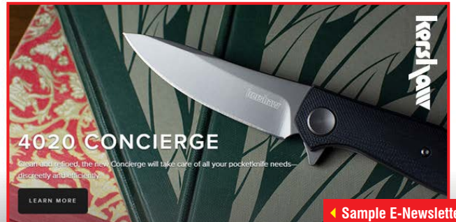
Sample E-Newsletter Ad