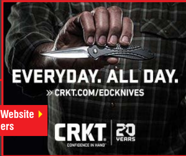
Sample Website Ad Banners