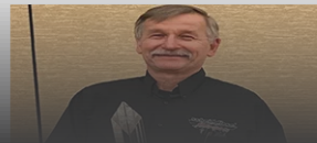
Sample E-Newsletter Ad