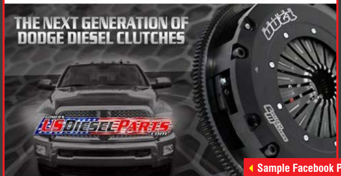
Sample Facebook Post

The 1200 Series has a higher holding capacity and is designed for excessive towing applications.