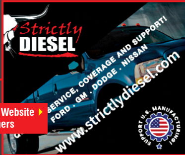
Sample Website Ad Banners